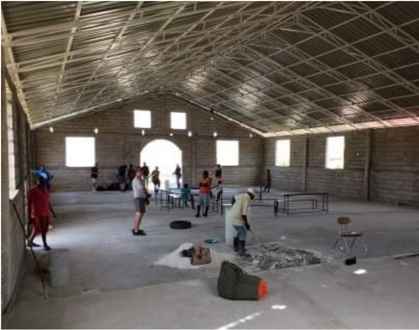
Finishing the floor at Village de Coracess