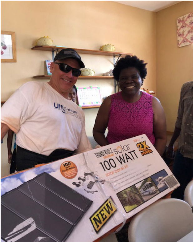
New solar panel for the orphanage